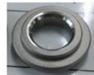
Table: Parts Code

Valve Seat made of SCS14 for all BA, BS and BF series.