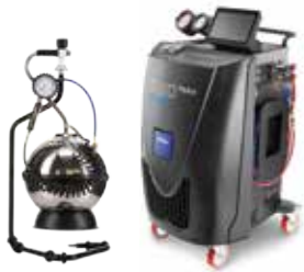
Portable tire air inflator / CFC changer