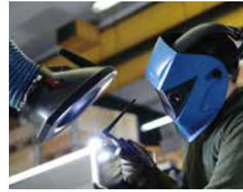
Stationary vacuum system