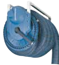
Electric powered exhaust hose reel