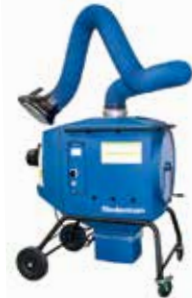
Welding fume /Fine dust collecting device