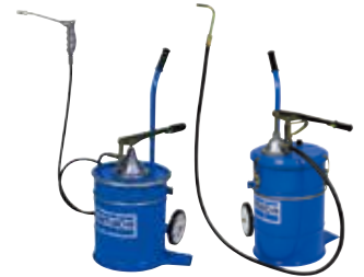
Grease/Oil hand bucket pumps