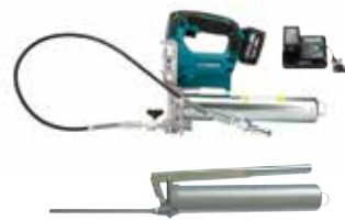
Electric powered grease gun / Hand operated grease gun