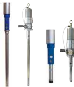
Drum pumps / Siphon pumps