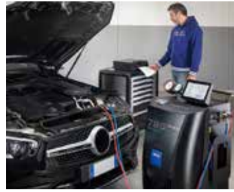
A/C recharge and maintenance stations